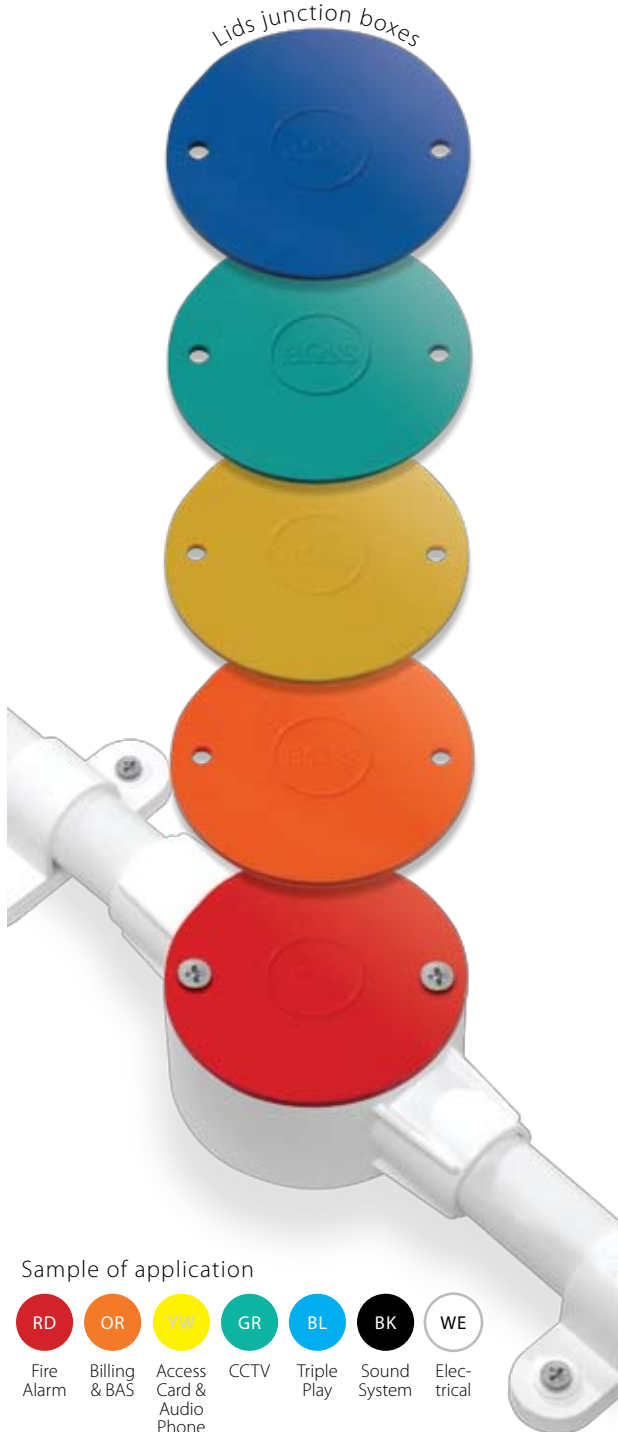
Sample of application